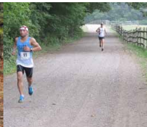
13th Annual Run for the Trails