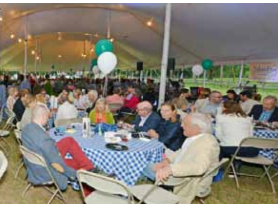
Summer Solstice Party