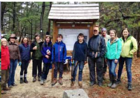
Turkey Hill Volunter Work Day