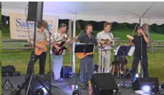
Labor in Vain Band at Summer Solstice Party