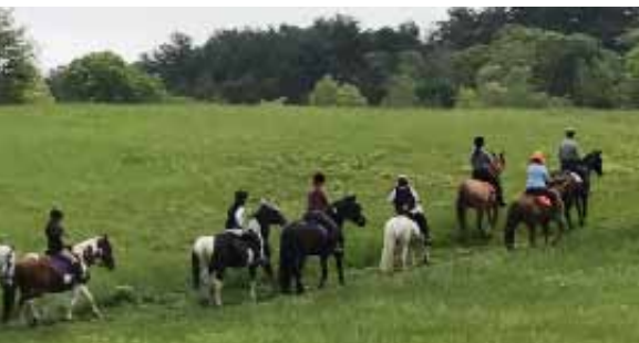
Spring Trail Ride

Essex County Trail Association P.O. Box 358 Hamilton, MA 01936