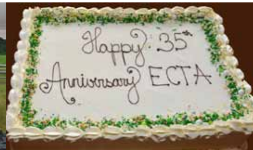
35th Anniversary Cake at Summer Party