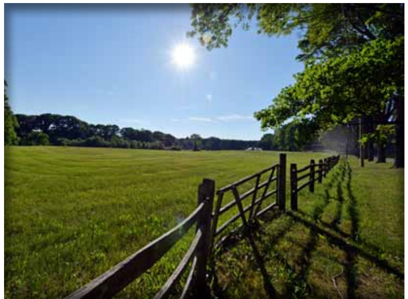
View from the Summer Solstice Party at Groton House Farm

We are excited to report that the Conservation Commissions in both Topsfield and West Newbury have extended our Townwide Trail Management Plans. This is exciting because these plans allow the ECTA to maintain trails in the wetlands and buffer zones without having to file a Notice of Intent with the State each time we have a project. The Management Plans were developed and implemented by the ECTA and they save us considerable time and money which in turn allows us to complete more projects each year. They strengthen our relationship with the Conservation Commissions as the renewal process is a collaborative effort where we work together to ensure the best Plan that works for everyone. They also strengthen our relationships with landowners and organizations as we can work with them to permit trail projects for which they otherwise would have to file. These Plans are exclusive to the ECTA.