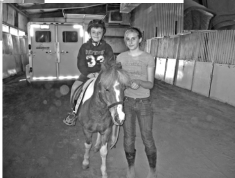
Canterbrook Equestrian provided pony rides to entertain the kids. The annual ECTA Equine Expo was held April 25th at the Topsfield fairgrounds.