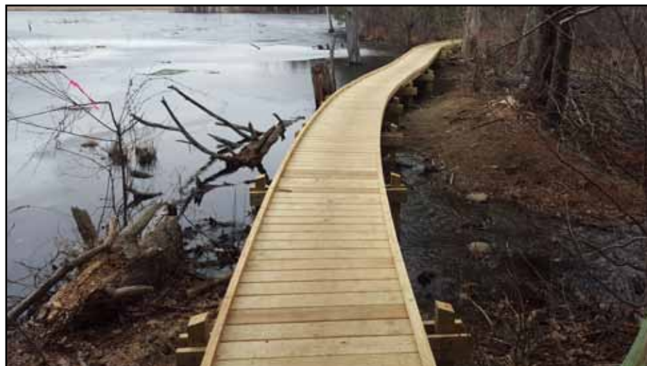
New boardwalk at Mill River; Rowley