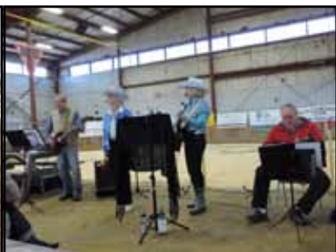
The Palomino Cowgirls, Equine Expo 2015