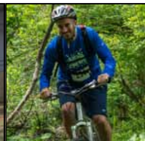
ECTAthlon 2015 Biking