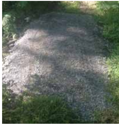
Finished Bradley Palmer trail repair project, Summer 2015

With a marvelous $5,000 grant from the New England Biolabs Foundation, ECTA completed a Bradley Palmer trail repair project. By repairing approximately 1,000 feet of eroded trails using stone pack, crushed stone and water bars, we were able to improve the experience of the Bay Circuit Trail and Discover Hamilton Trail for trail users.