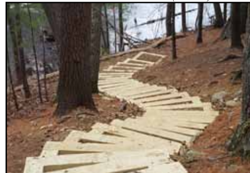
New stairs at Mill River (below)