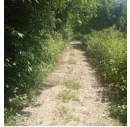
Blackbrook Trail after repairs, Summer 2015 (above)