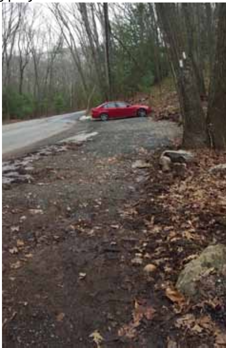
New parking lot on Boxford Road (above)

This project was fun because so many people wanted it to happen. It was fun because everyone did their part and they did it well. And the final product is just beautiful.