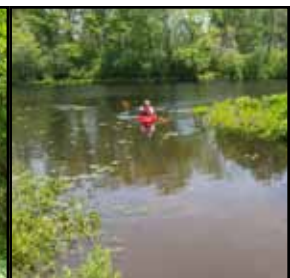
ECTAthlon 2015 Kayaking