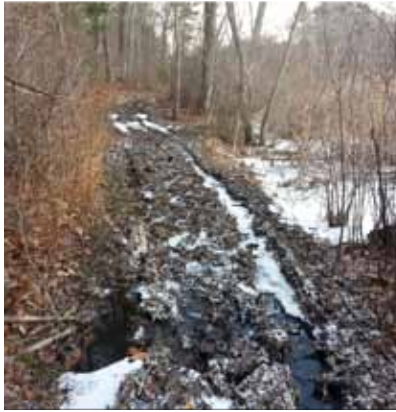
Blackbrook Trail before repairs, Winter 2015 (above)

The Fields Pond Foundation gave ECTA a generous grant of $7,400 to go toward much needed maintenance along the Discover Hamilton and Blackbrook trails. Along with the generous support of ECTA members and neighbors, we repaired five water crossings, mowed and cut back the section from Cutler Road to the causeway at Pingree Reservation, added pack to a 300 ft. stretch, and installed a new beaver deceiver. The before and after photos are incredible!