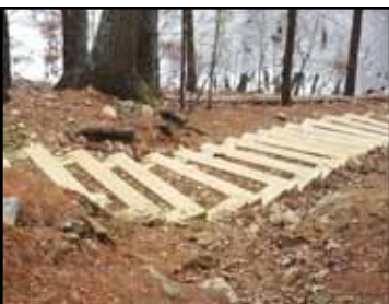
Steps at Mill River, Rowley