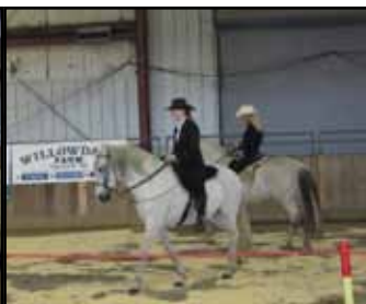
Paso Fino del Fuego Farm, Equine Expo 2015