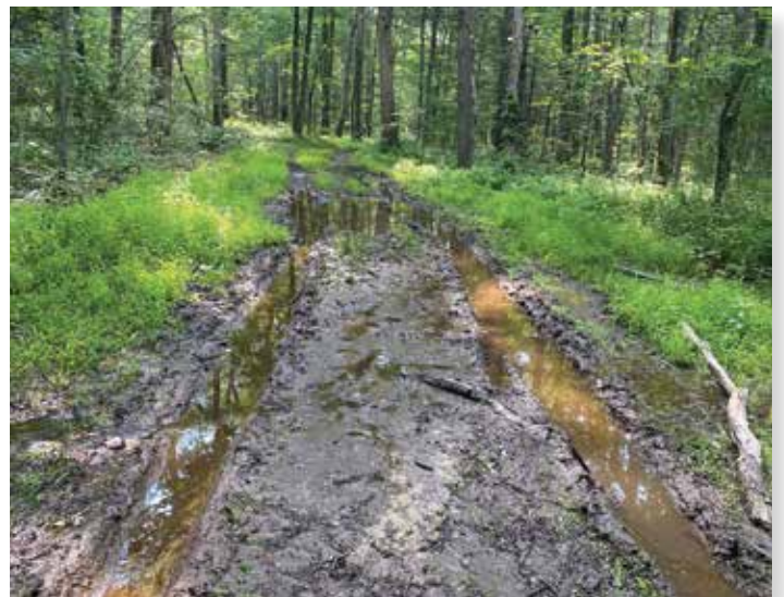
BEFORE: Main trail Donibristle Reservation

A second project was to repair a trail in Greenbelt's Donibristle Reservation in Topsfield. The main trail is always muddy as it's positioned at the bottom of a hill where the run off flows onto it. We had the pleasure of working with ECGA on this project. We all agreed that work needed to happen and that we could do more together. As a result, Greenbelt permitted the project and built a boardwalk in another muddy section. Utilizing contractor TW Excavating, ECTA oversaw and paid for the repair of the main trail muddy section. The trail was built up by using larger stone on the bottom to allow for better drainage and a small culvert was installed giving the water some place to go other than right over the trail. You can see the difference we made with the before and after pictures!