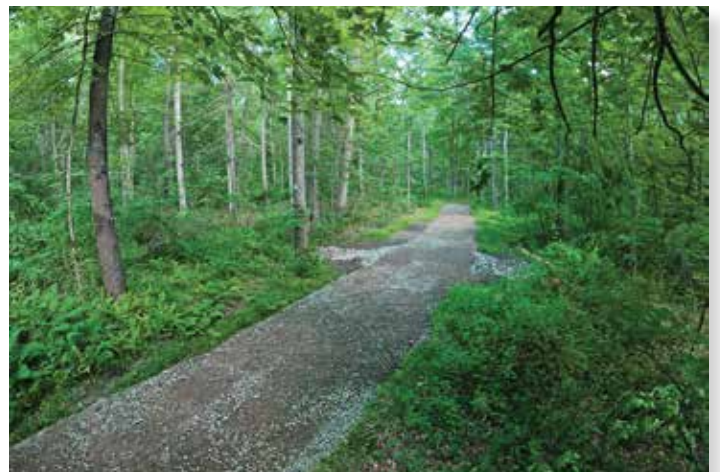
AFTER: Main trail Donibristle Reservation